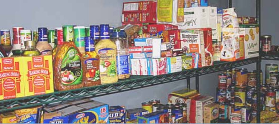
Donated food items